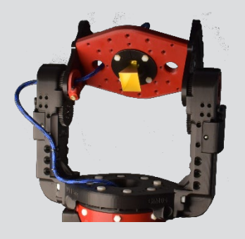
Tangle free wiring