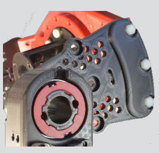
2 platform depths